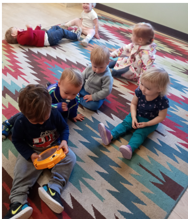
"Don't Stop The Music"