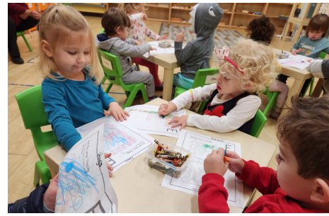
"E Is For Elephant"