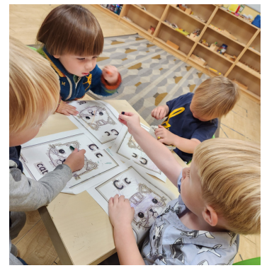
"C Is For Cat"

Students from CH 1-1 have been exploring the English alphabet. Every week we try to master a new letter. Our goal is to recognize the letter and recognize the sound each letter makes. We even discover words that start with each letter. C, D, and E were so much fun to learn. We plan to continue focusing on letters in the coming months. Colors, shapes, and numbers are also on our to-do list! We appreciate you sharing your little one with us!